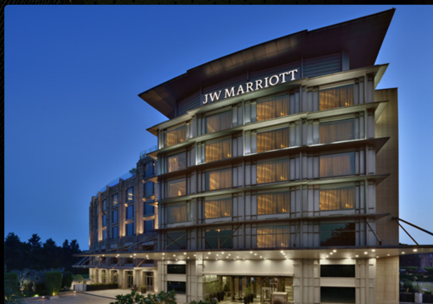
JW Marriott Chandigarh