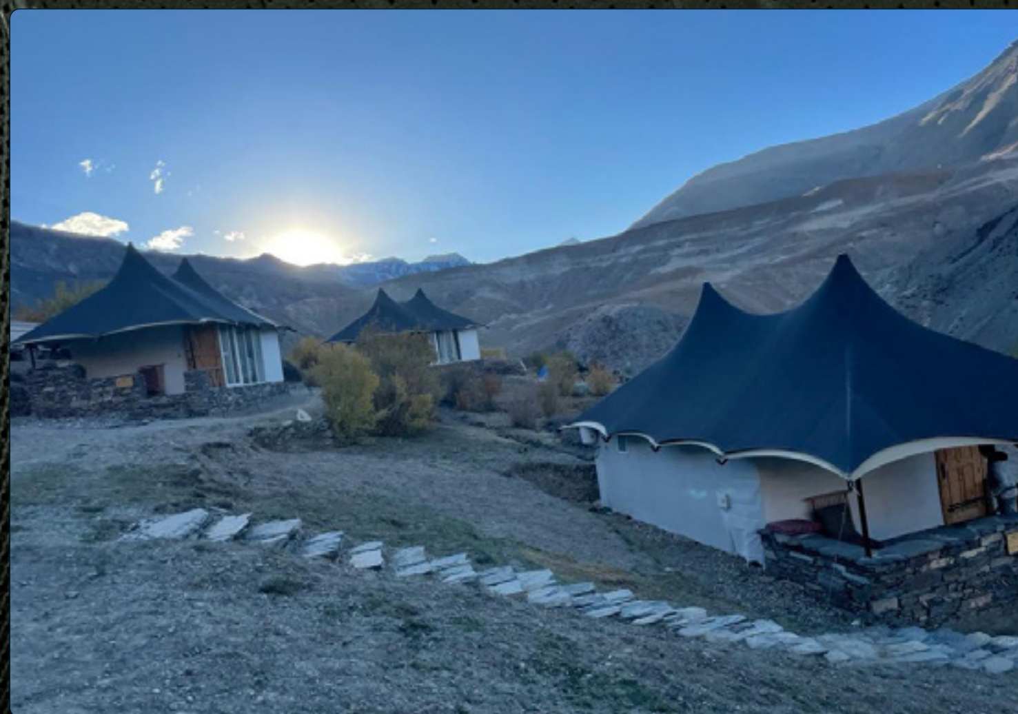
Tara Mountain Sarai