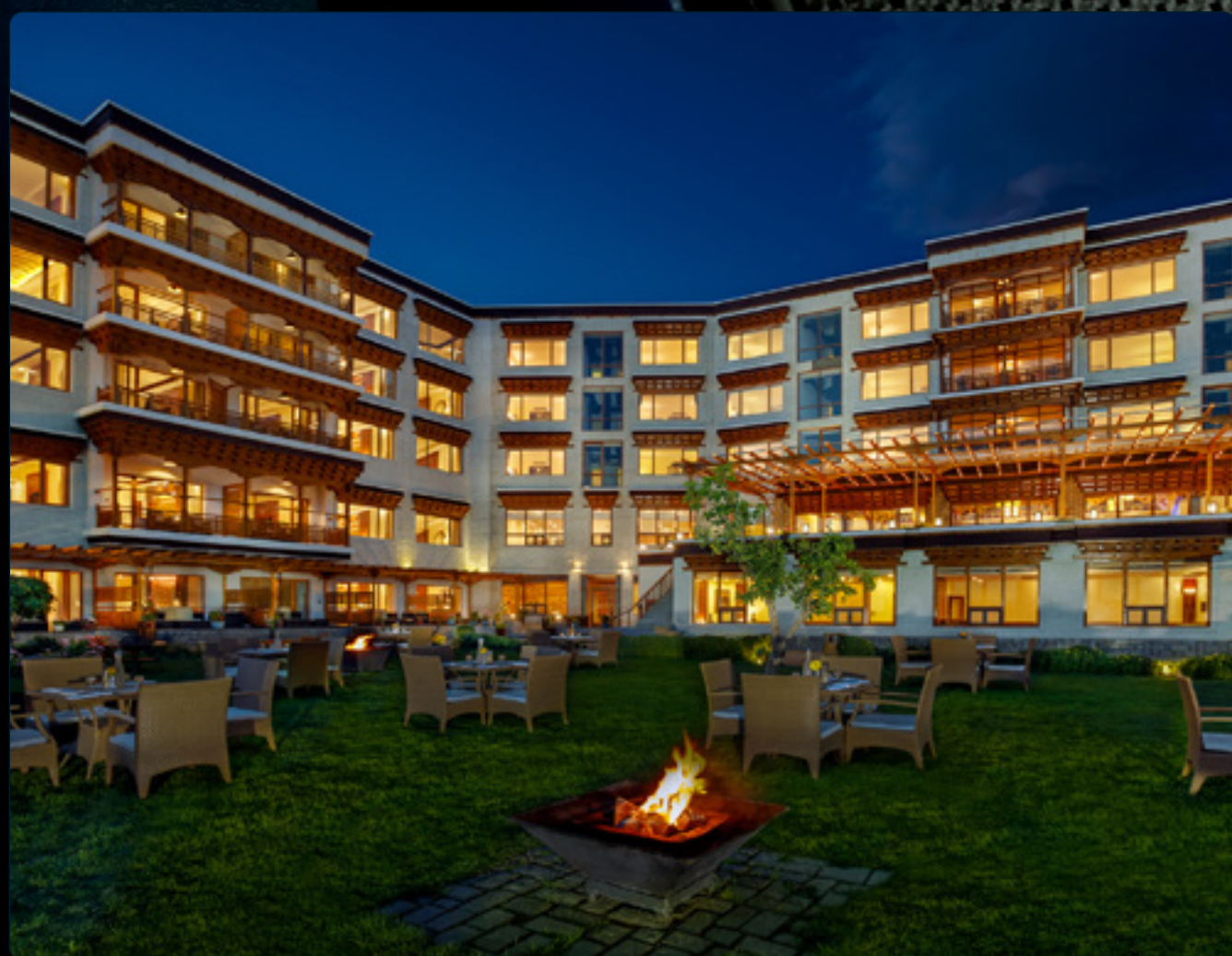
The Grand Dragon Ladakh