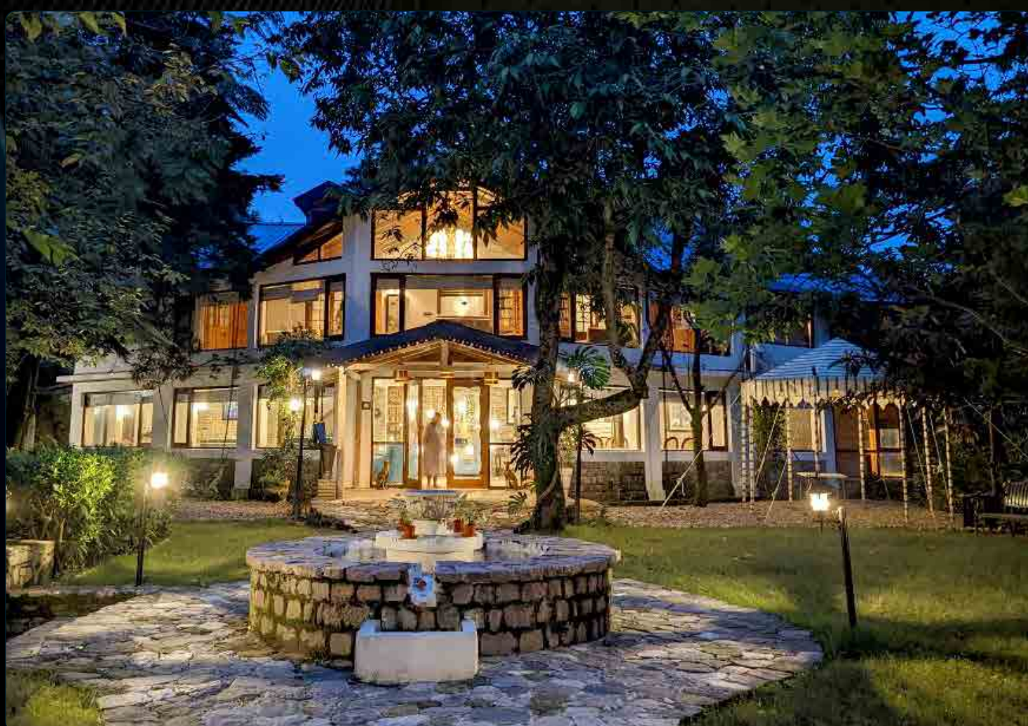
Blue Book at Gethia