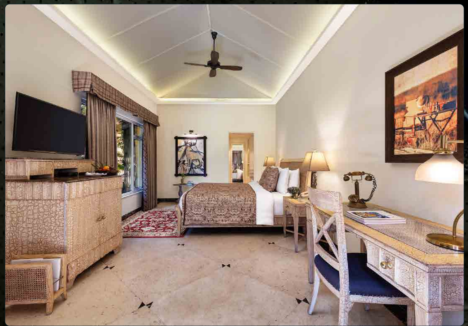
Taj Corbett Resort & Spa