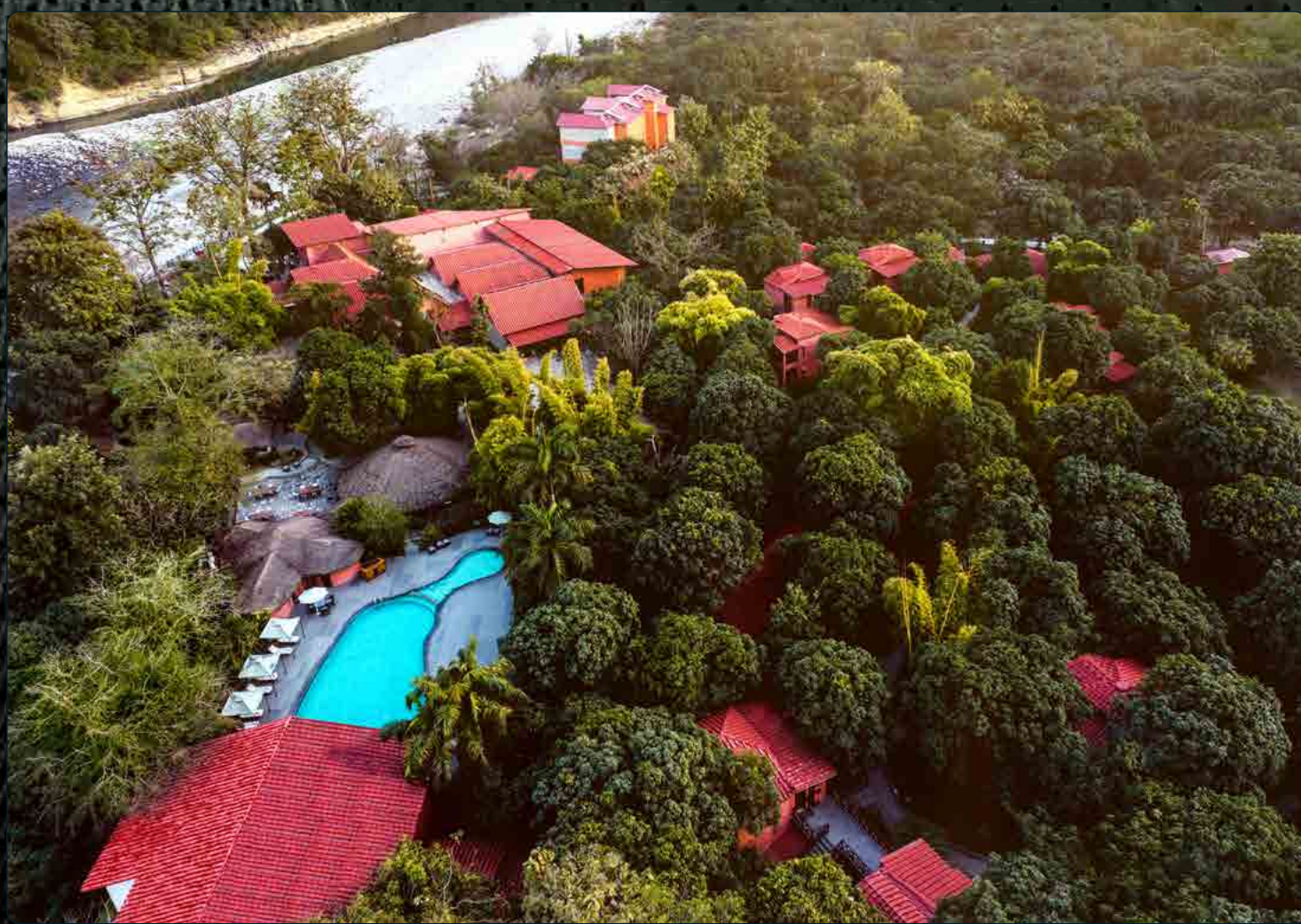
Taj Corbett Resort & Spa