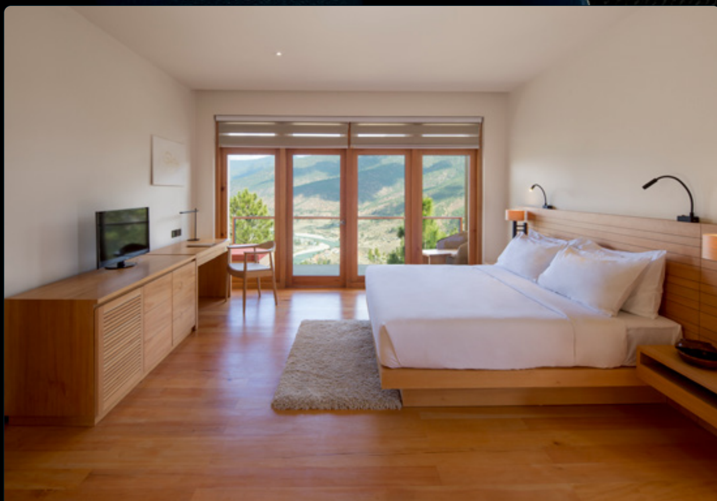
Dhensa Boutique Resort