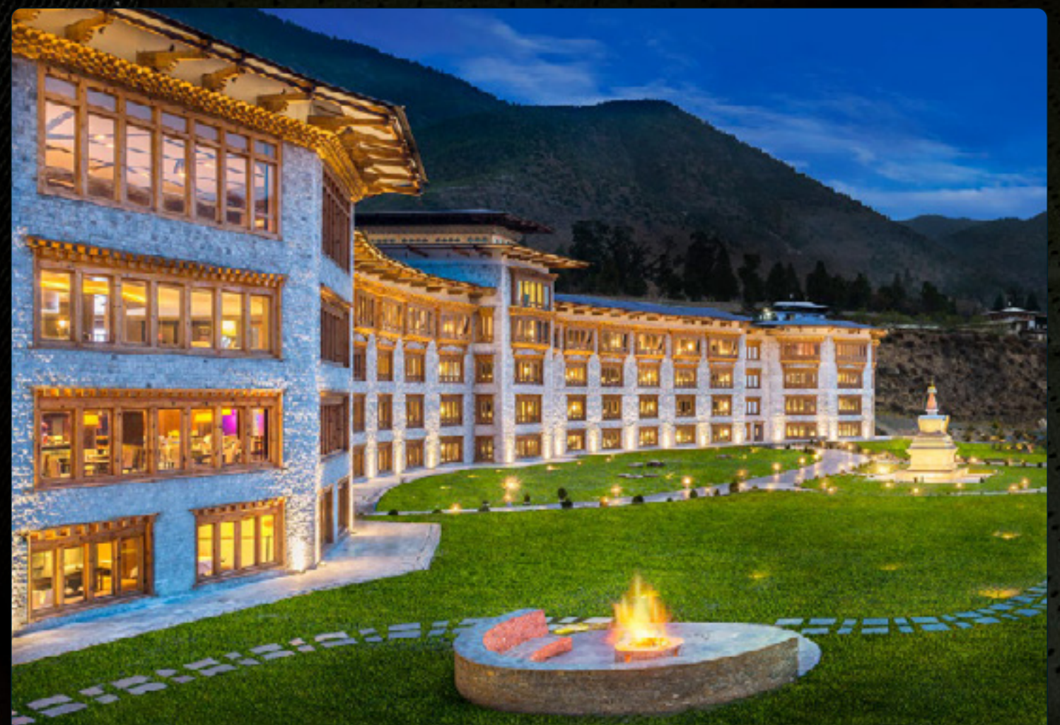
Le Méridien Paro