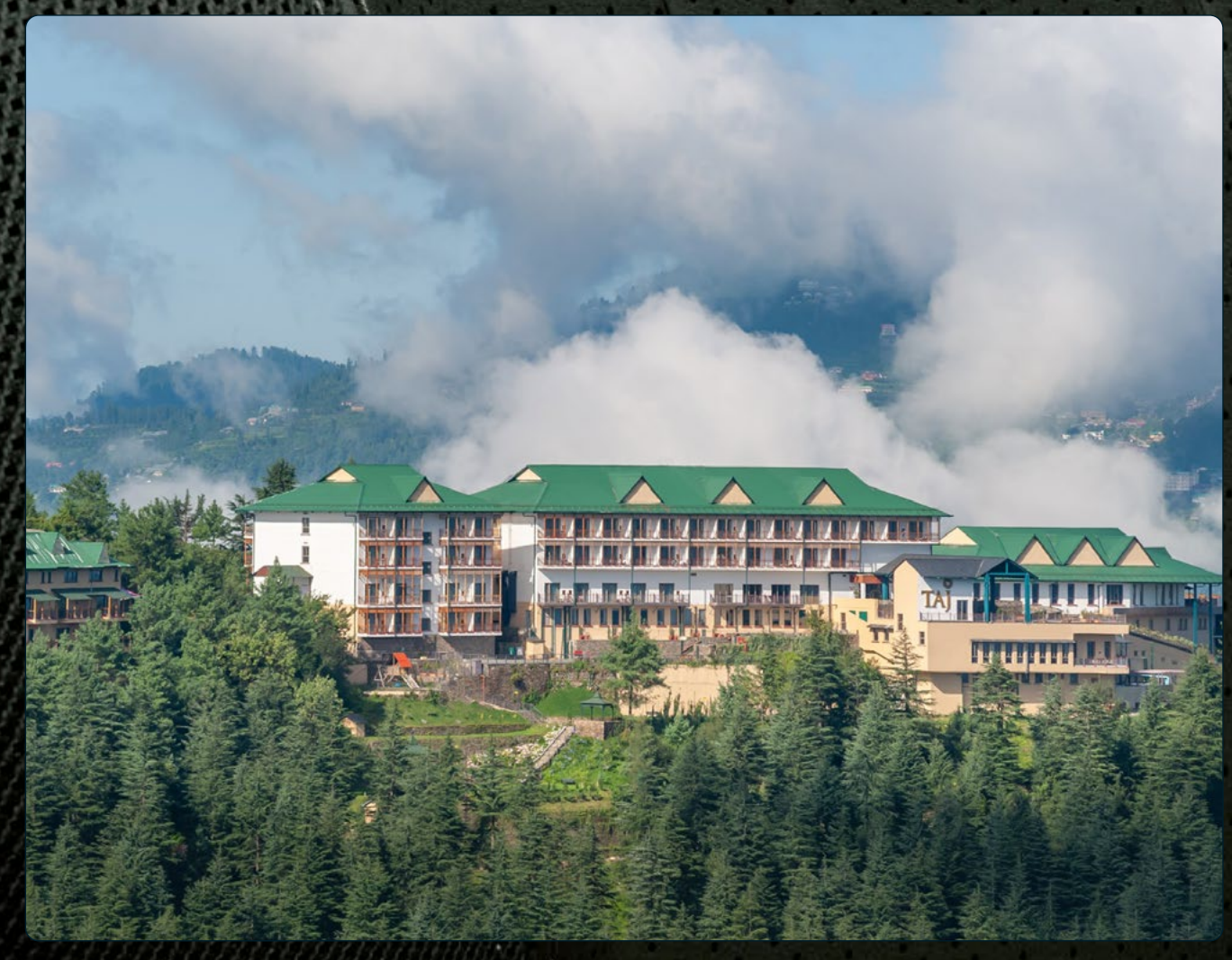
The Taj Theog Resort & Spa

Luxury 5-star hotels, boutique retreats, and eco-friendly accommodations