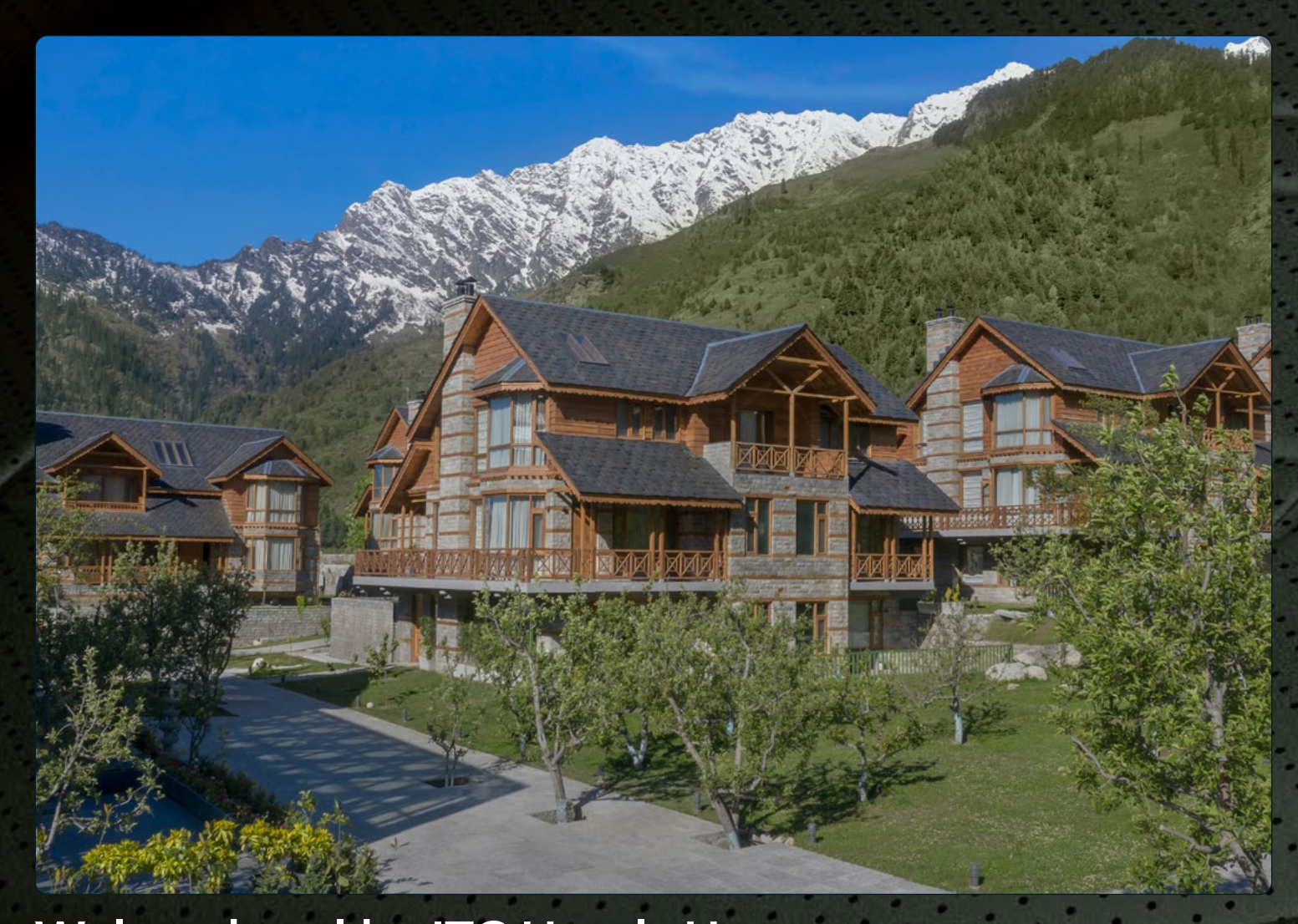
Welcomhotel by ITC Hotels Hamsa