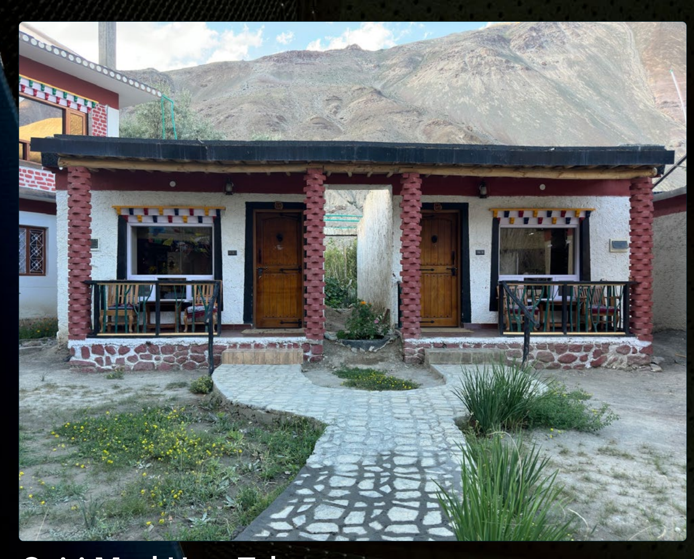
Spiti Mud Huts Tabo