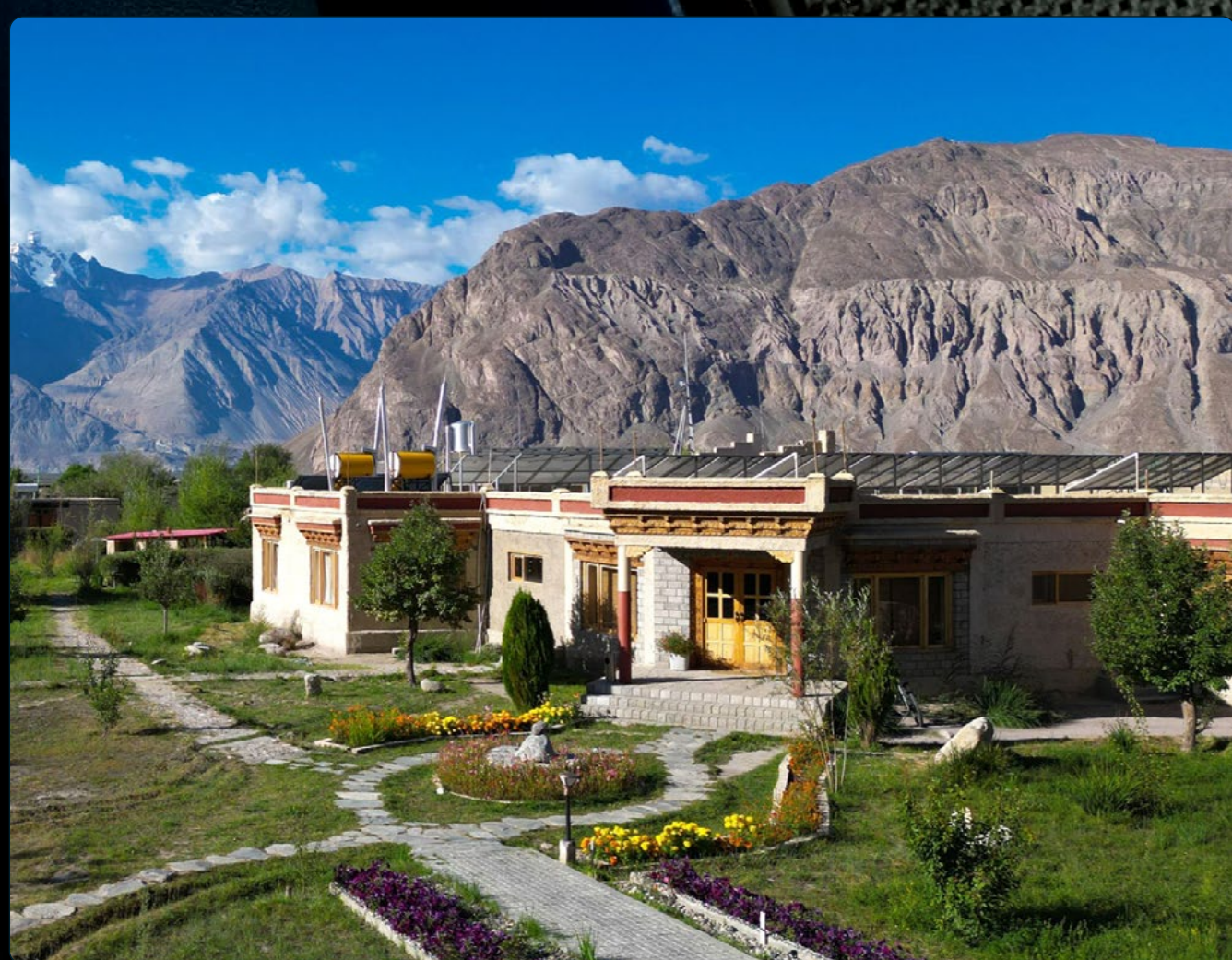
Lchang Nang Retreat

Luxury 5-star hotels and boutique resorts