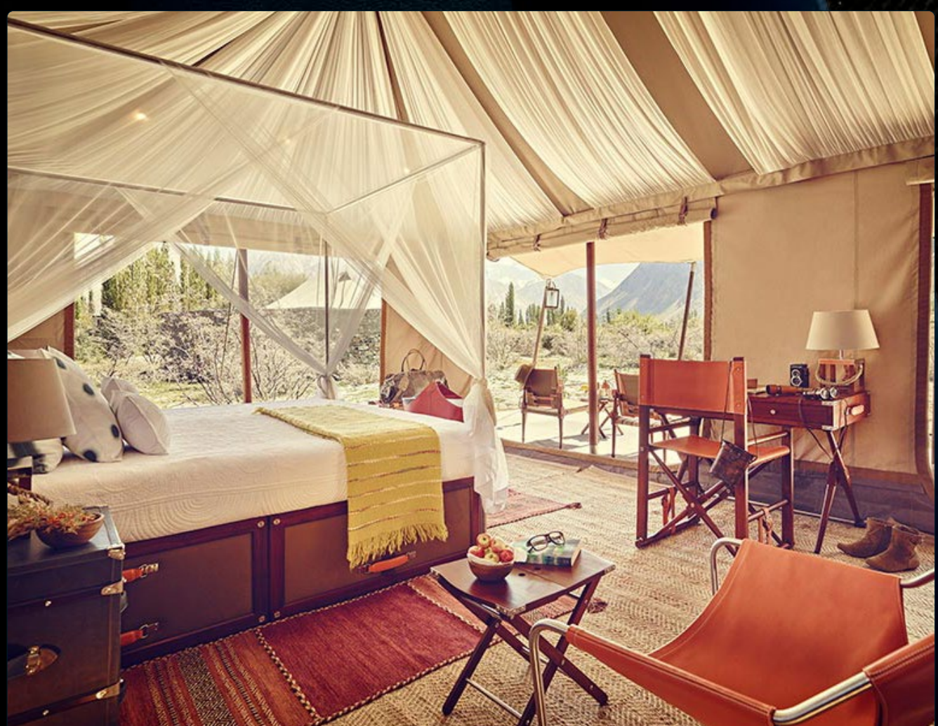
TUTC Chamba Camp Diskit