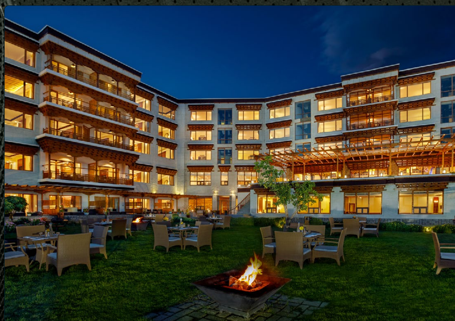
The Grand Dragon Ladakh