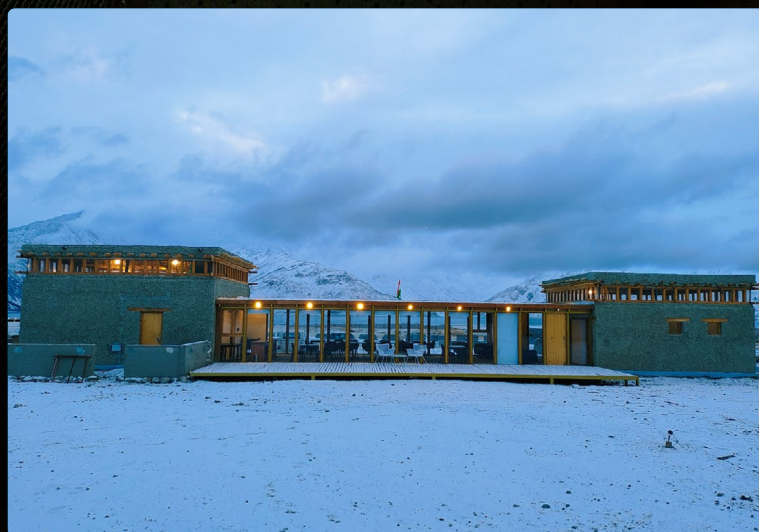
The Merak Pangong